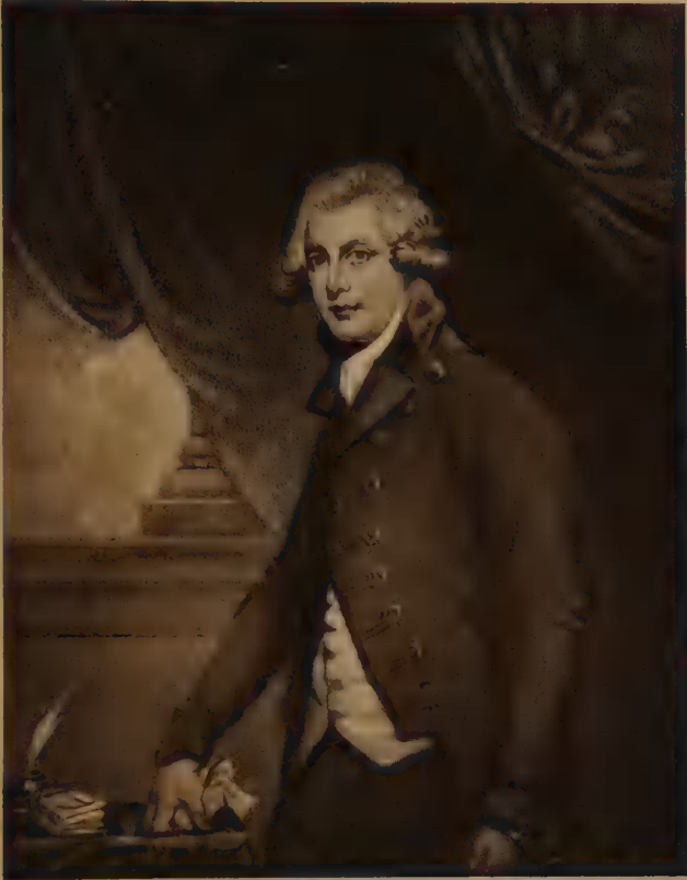
Painted by Sir Joshua Reynolds, P.R.A.